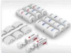
可移动式火眼实验室系列产品 Movable "Huo-Yan" Product Series