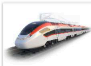
新一代动力集中型动车组 Power-concentrated EMUS of New Generation