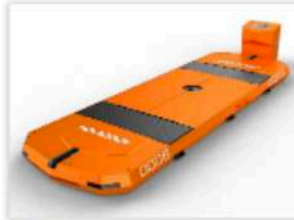
泊车AGV Parking Robot