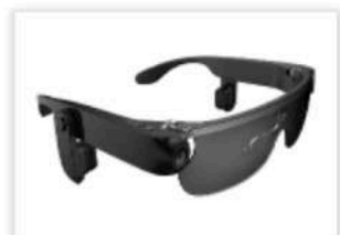
盲人视觉辅助眼镜 II The visual assisting glasses for the blind II