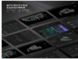
盘古药物分子大模型智能加速药物研发 Pangu BigMol to Accelerate Drug Discovery with AI