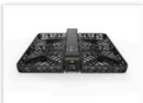
小黑侠 Hover Camera Passport