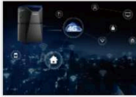
集中式油烟排放系统 Centralized Fume Exhaust System