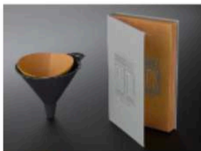
可以喝的书 Drinkable Book