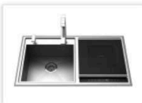
方太水槽洗碗机 Sink Dishwasher