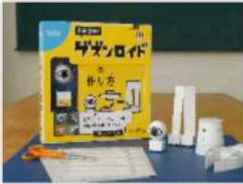
Toio专用套件 Papercraft Creation -Gesundroid