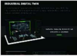
阿里云 - 工业数字孪生 Alibaba Cloud - Industrial Digital Twin