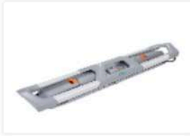
便携式智能光伏清扫 IFBOT X3 Solar Panel Cleaning Robot